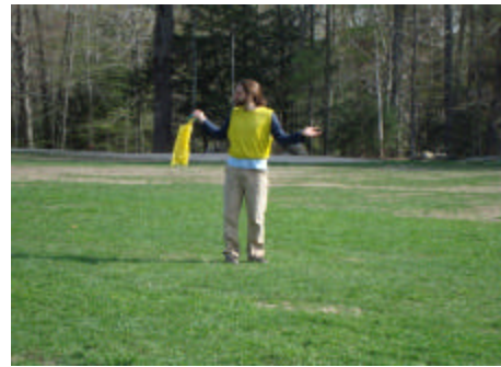
Capture the Flag